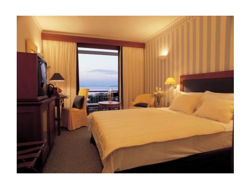
Deluxe Residence Suites

This one bedroom suite offers sitting area with a sofa bed and a marble lined bathroom. Special features include 2 televisions, CD player in the living room, mini TV set in the bathroom and free wifi high-speed Internet access. Occupancy 2 adults and 2 children or 3 adults, size 40 sq.m.