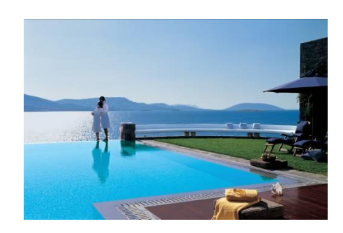
Executive Suites with private pool

Located on the east side of the peninsula. The luxurious bedroom is secluded from the living area by wooden door. Features include fireplace, walk-in wooden closet, in-room safe, two televisions, CD player, free wifi high-speed internet access, executive wooden deck and an outdoor heated* pool. The full marble bathroom offers a deep soaking tub and separate glassenclosed shower and steam bath. Occupancy 2 adults and 1 child or 3 adults (rollway bed), interior size 78 sq.m., exterior 100 sq.m.