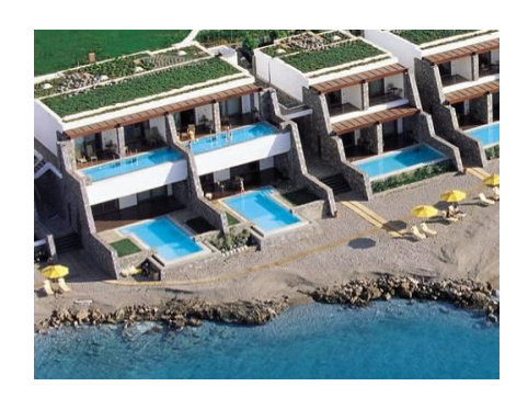
Residential Cabanas with pool Complex of 2 Separate Bedrooms

Waterfront cabanas located on the ground or upper level at the west side of the peninsula. Bedroom and living room in open plan style and marble oversized lined bathroom features a deep soaking tub, separate WC and separate glass-enclosed shower / steam bath. Special amenities include gym area, walk-in wooden closet, CD player, free wifi high-speed internet access, in room safe, TV and private wooden terrace opens to sunset views and accommodates a shared heated* edge-pool. These cabanas can be configured as two-bedroom suites with connecting door.