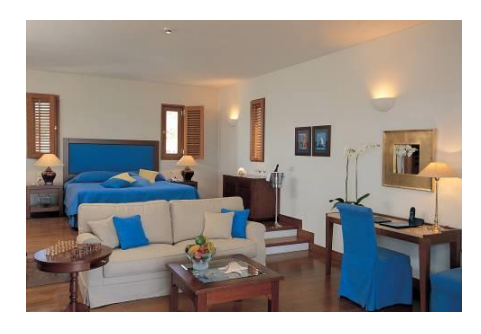
bedroom and sitting room area, marble lined bathroom with separate glass-enclosed shower / steam bath and air bathtub. Special features include a walk in closet, TV in sitting area, mini TV set in bathroom, CD player, free wifi high-speed internet access, remote controlled mattress and private garden. Occupancy 2 adults, size 70 sq.m.

Located on the southwest side, feature one open plan style