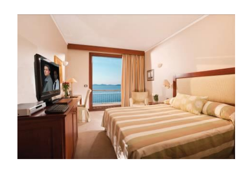
Luxury Rooms with sea view

One bedroom panoramic sea view room with marble lined bathroom and private balcony or terrace. Free wifi high-speed Internet access. Maximum occupancy 2 adults, size 22 sq.m.